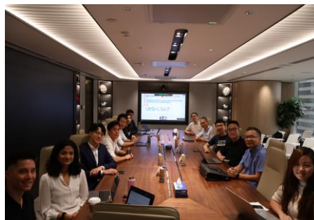
iDendron Legal Day / IP Day 活動