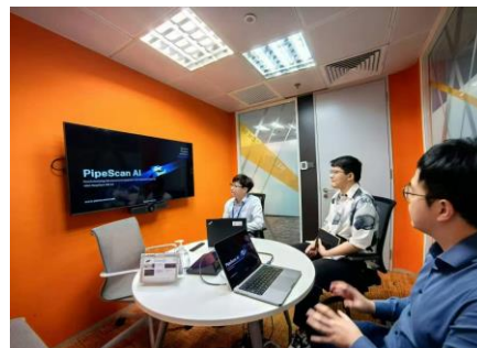
項目路演 市場合作 Project Pitching Market Exploring