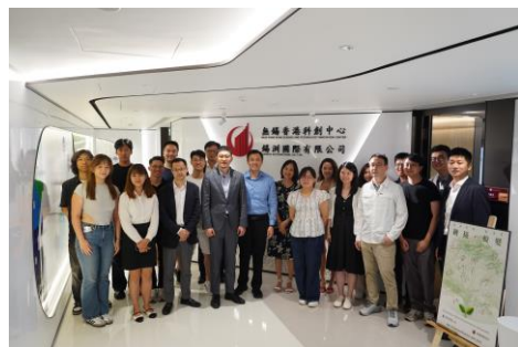
首批項目入駐 Open Day