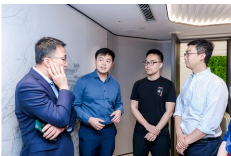
投資人對話 Investor Networking