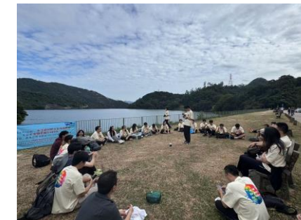
創科概念驗證加速營 Acceleration Camp