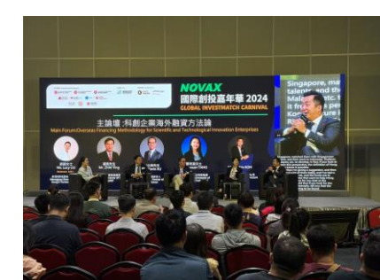
行業論壇 & 展位佈展 Forum & Booth