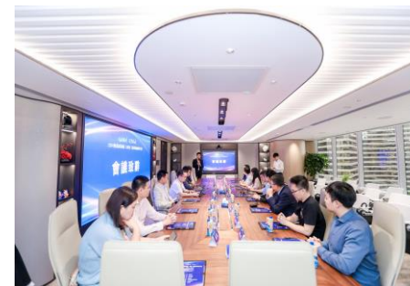
產業研討沙龍 Industry Engagement