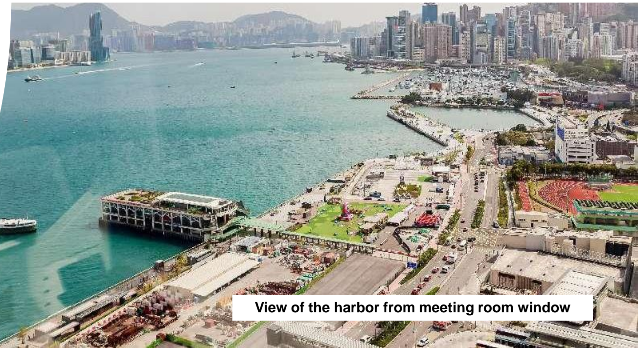
View of the harbor from meeting room window