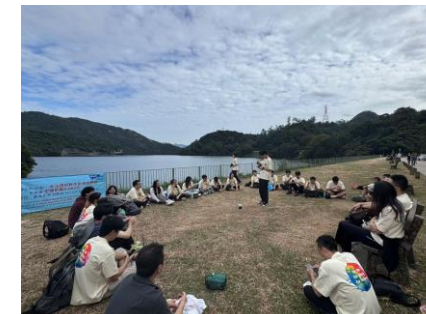
創科加速營 Acceleration Camp