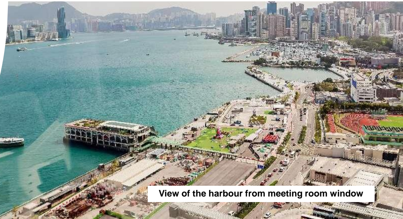
View of the harbour from meeting room window